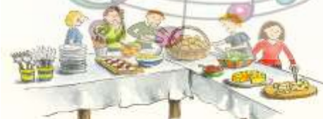
Wed Feb 5 Menu-Tacos & Hot dogs

January through May and August through December a meal for all will be served on the first Wednesday each month. No meals will be served in June and July. The meals will start at 5:30 and we will remain in the back for the singing service and lesson. Hope to see all there.